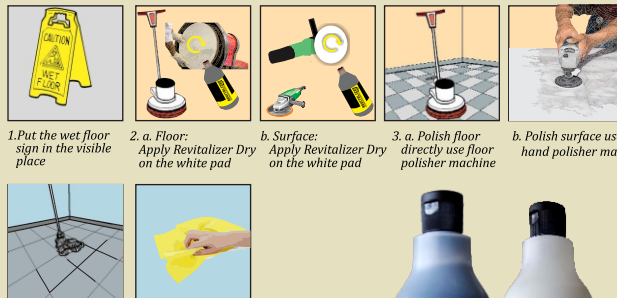
1. Put the wet floor sign in the visible place 2. a. Floor: Apply Revitalizer Dry on the white pad b. Surface: Apply Revitalizer Dry on the white pad 3. a. Polish floor directly use floor polisher machine b. Polish surface use hand polisher machine 4. a. Mop the residue use floor finish mop b. Mop the residue use chamois cloth and microfiber cloth.