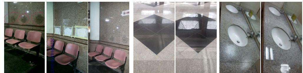
*Before *Maintenance *After *Before *After *Before *After