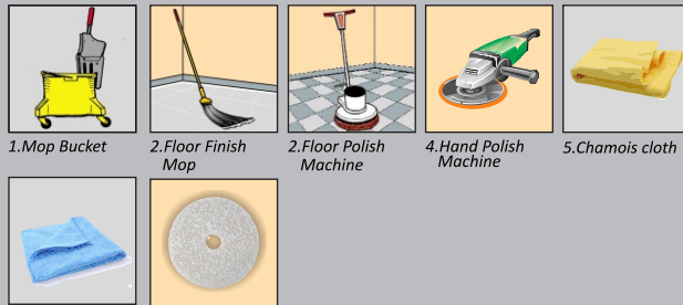
1. Mop Bucket 2. Floor Finish Mop 2. Floor Polish Machine 4. Hand Polish Machine 5. Chamois cloth 7. Microfiber cloth 8. White pad